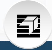
Filatex textiles limited