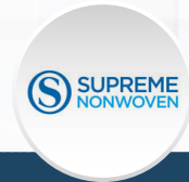
Supreme Nonwoven Industries Pvt. Ltd.