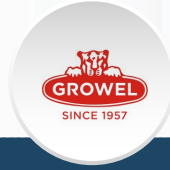
GRAUER & WELL (INDIA) LIMITED