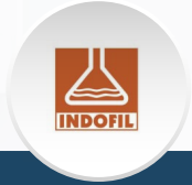
Indofil Chemical Company