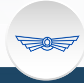
KARISH INNOTECH PVT LTD